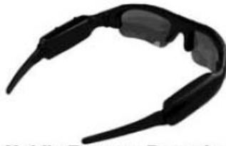
Mobile Eyewear Recorder